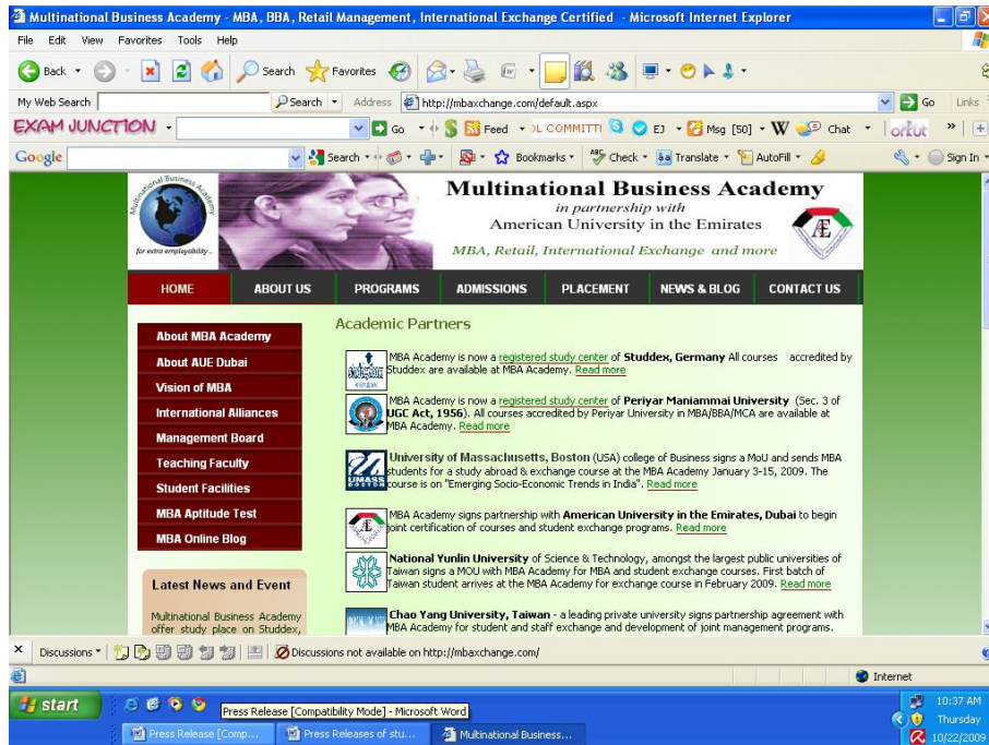
Multinational Business Academy(www.mbaxchange.com)